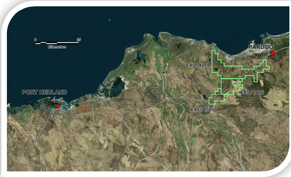
Figure 2: Pardoo Project location map showing tenement portfolio.

The Pardoo Nickel Project is located in the Northern Pilbara, 100km east of the regional centre of Port Hedland. The Project is prospective for magmatic nickel-copper sulphides ( Figure 2 ). A current inferred resource of 50mt @ 0.3% Ni and 0.13% Cu exists at the sedimentary hosted Highway Deposit.